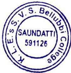
Custodian G.S.S Valuation Center