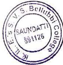
PRINCIPAL K.L.E.Society's S.V.S.Bellubbi Arts & Com College, Saundatti.